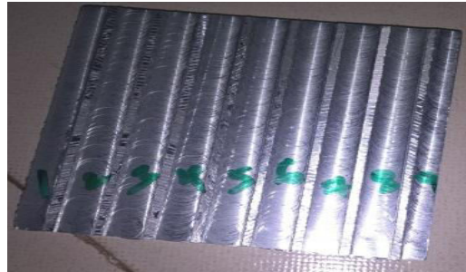
Figure 2 Work piece 6463 Aluminium Alloy