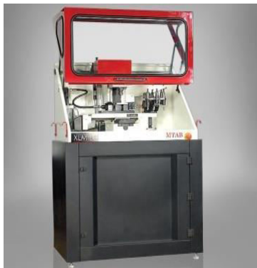
Figure 1: Working Machine XL Mill

Working Machine: For the experiments XL CNC Machine is used