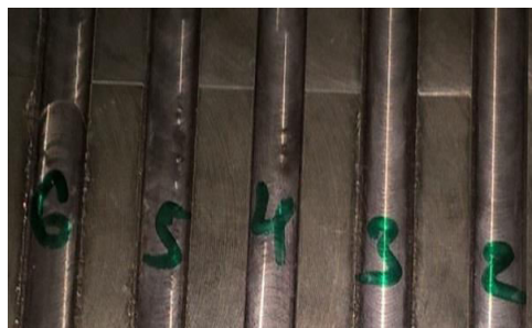
Figure 3 Work piece Brass

Surface Roughness Tester: Taylor Hobson Surface tester is used for taking Ra values. It contains a probe which is movable. By some force this probe is moved on surface of work piece.