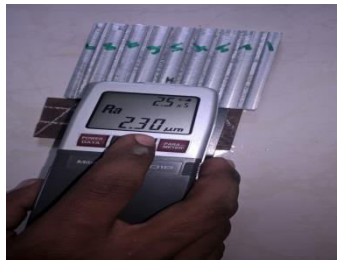
Figure 4: Surface roughness tester (Talysurf)

Surface Roughness Tester: Taylor Hobson Surface tester is used for taking Ra values. It contains a probe which is movable. By some force this probe is moved on surface of work piece.