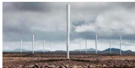
Figure 1. Vortex windmill

In these days non renewable energy sources are gone to the depth of earth, so we can obviously produce energy by renewable energy sources. Wind energy has become a legitimate source of energy over the past few decades. The construction of bladeless windmill is quiet simple. The conical mast is pivoted vertically with the help of cylindrical rod which is held within roller bearing in such a way that it vibrate in one direction only. The portion below pivot is covered with help of metal sheet. The upper part of mast flutters in wind while crank shaft is connected to lower part.